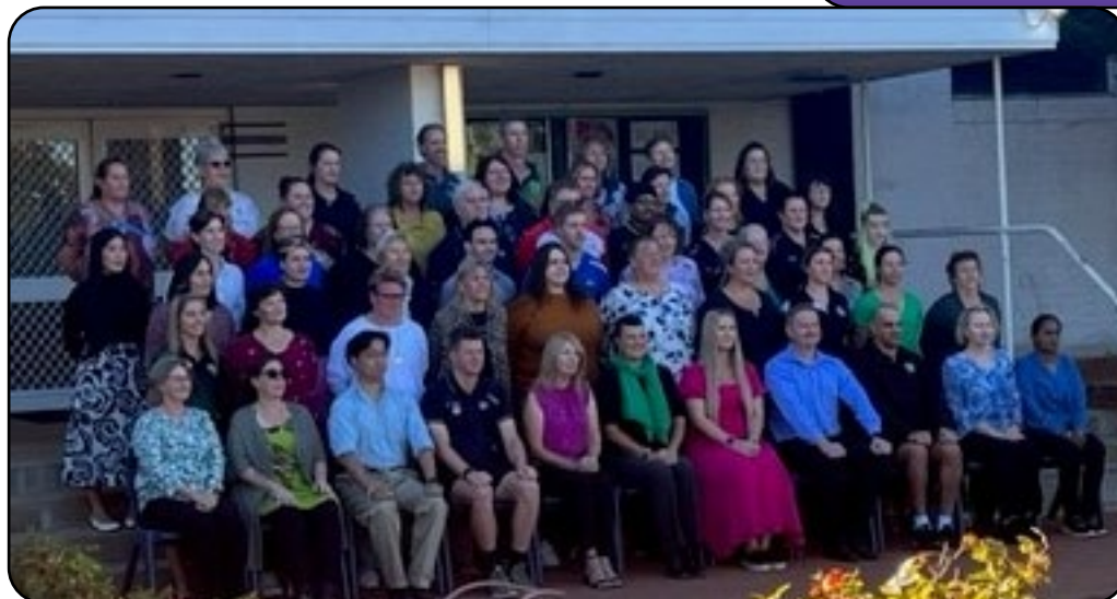
Smile for the camera - Photo day.