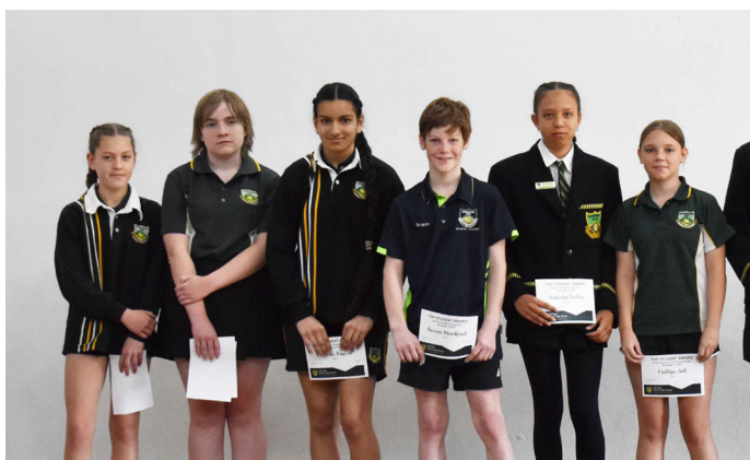
Year 7 Top Students