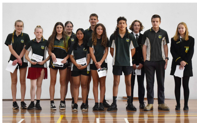
Year 9 Top Students