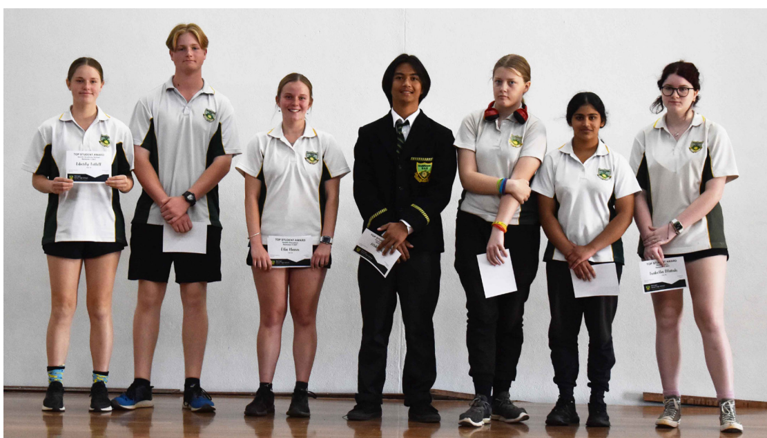
Year 10 Top Students