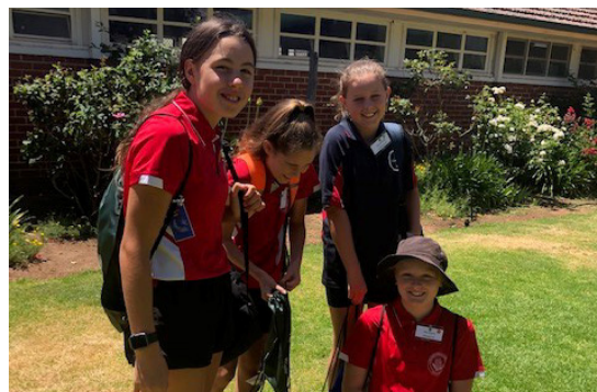
Enjoying Transition Day