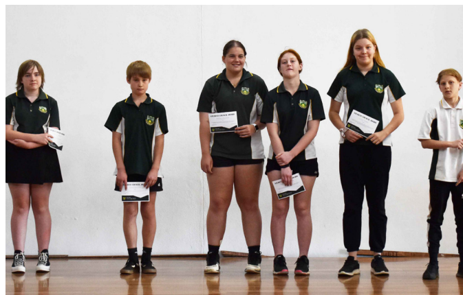
Student Councillor Award Recipients