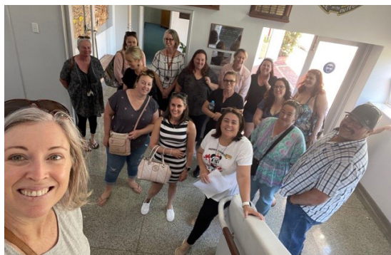
One of the two groups of parents engaged in the tour of the school