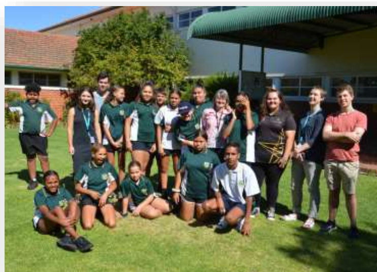
Trainee doctors visited NSHS Follow The Dream Program