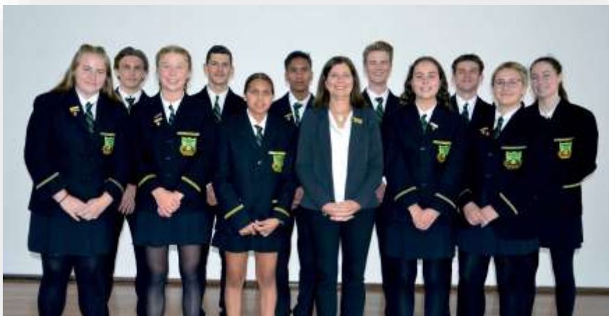
Narrogin SHS Yr 12 Prefects