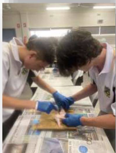
Year 11 ATAR Physical Education Students dissect chicken wings as part of their functional anatomy lessons.