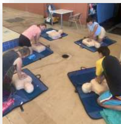
Staff participating in Bronze Medallion Training