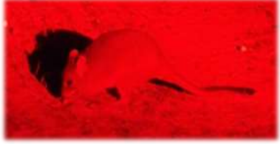
Woylies at Barna Mia. Red filters on spotlights do not disturb nocturnal animals, so their behaviour can be observed.