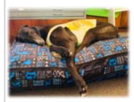
Cosi taking a well earned nap from his time in the Library