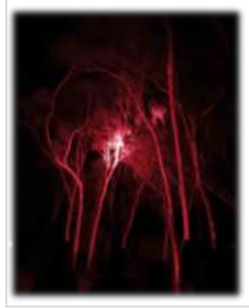
Possum count. Night surveys with red lights are a great way to see nocturnal animals in their natural habitat. Also a great way to walk off a fantastic meal!