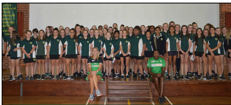
West Coast Fever & Australian Diamond player Courtney Bruce and fellow WC Fever player & Jamaican Netballer Jhanelle Fowler

Parent/Teacher evening is upon us and we value these evenings talking with parents about the education of their child. If you were unable to attend please feel free to email teachers to arrange an alternative time.