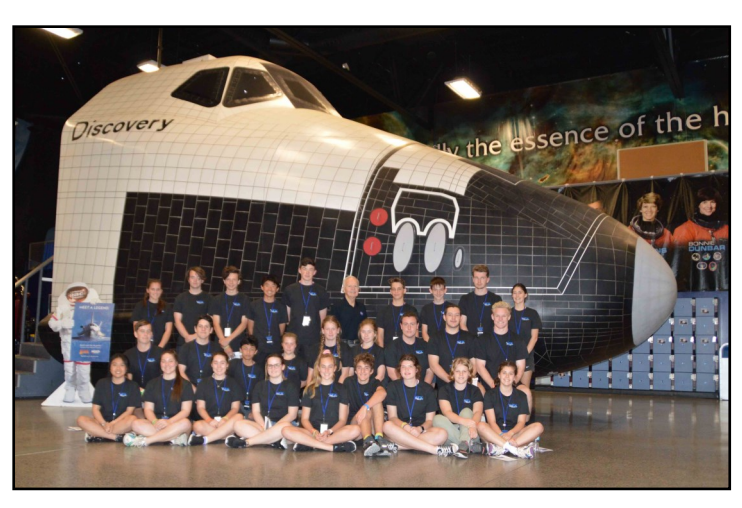
Astronaut training at NASA with Shuttle Payload Specialist JD Bartoe