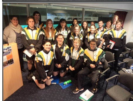
Main Roads Traffic Operations Centre