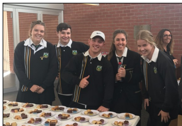
Students at Morning Tea

We are utilising the Facebook page more and more as we feel this provides an avenue for us to get information out to the community in a timely manner. Please make sure you have access to this to keep up to dates with good news stories and celebrate with us. We also find that event reminders are most successful using Facebook.