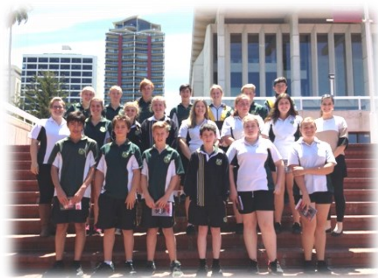
The Music students in front of the Perth Concert Hall

The excursion was overall very successful and the students loved the experience and the opportunity.