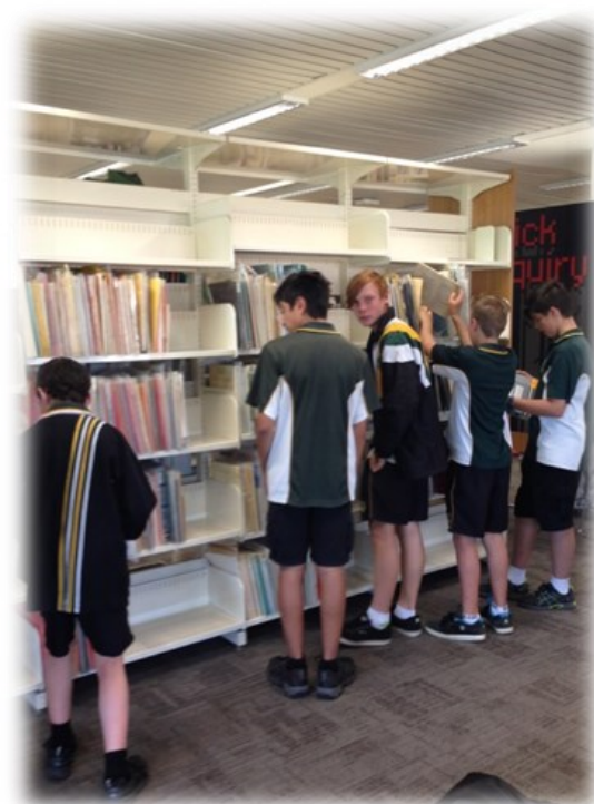
Checking out the Library facilities