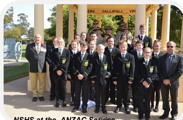
NSHS at the ANZAC Service