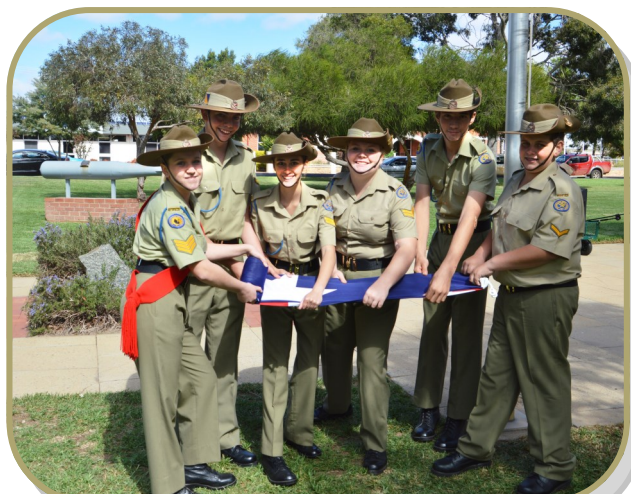
Cadets folding the flag after the ANZAC service.