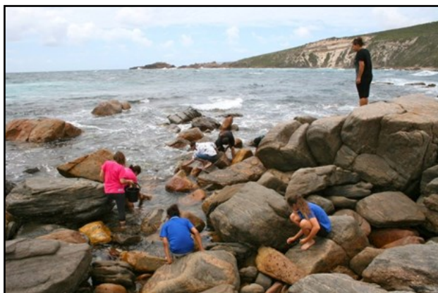
Students also foraged off the country for one of the courses consisting of Periwinkles.