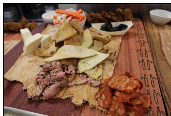
A shared platter of Bush Meat which included Crocodile Sausages, Emu, Abalone and our coat of arms.