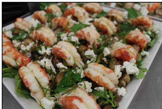
Highlights of the meal were Local Marron with Geraldton Wax.