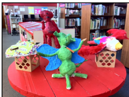
Creative Creatures Library Display

The Year 8 students have been developing their imagination to create original and quirky sculptures, which you can see displayed in the library for the last two weeks of school. The students used a variety of upcycled materials such as jumpers and t-shirts to produce the variety of textures, and range of colours, that make these works so appealing to look at. Please make the time to visit the library and enjoy this amazing array of creative works by our Year 8 students.