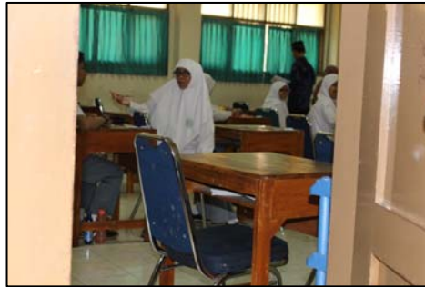
Moments away from the final Year 12 exam 'Bahasa Inggris'

During my visit the Year 12 students were undertaking the National exams which are our equivalent to WACE exams. Upon my return to NSHS several of my Year 12 students were rather envious that these students finish schooling in April and not the end of the year. I also met with several students and they were excited about coming to visit Australia next month.